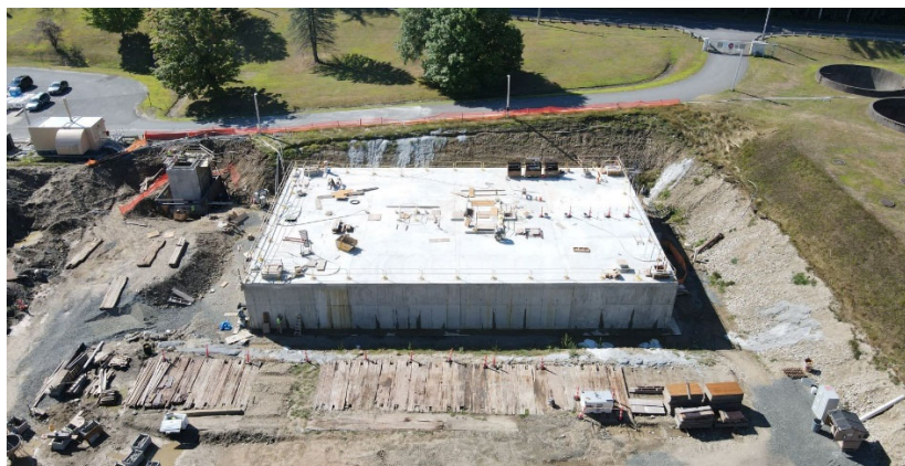
Clearwell structure – concrete work completed