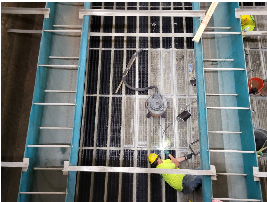
Installation of the new Leopold block-style underdrain system

Schedule: Project completed in August 2022 (originally July 2022).