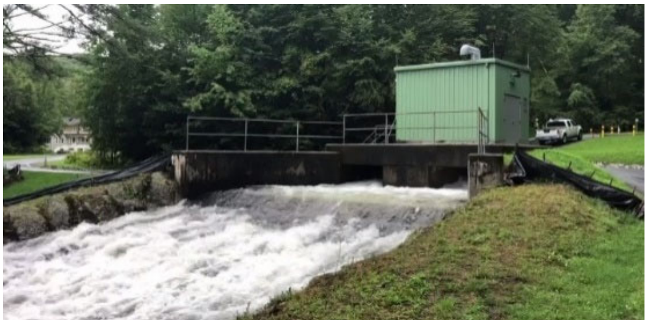
Outlet of the 42-inch bypass water supply main at the Sedimentation Basin

Schedule: Project anticipated to be completed end of 2024.