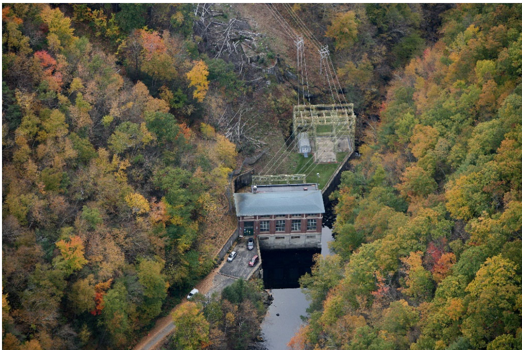
Cobble Mountain Hydroelectric Station

Schedule: Project schedule has not yet been established.