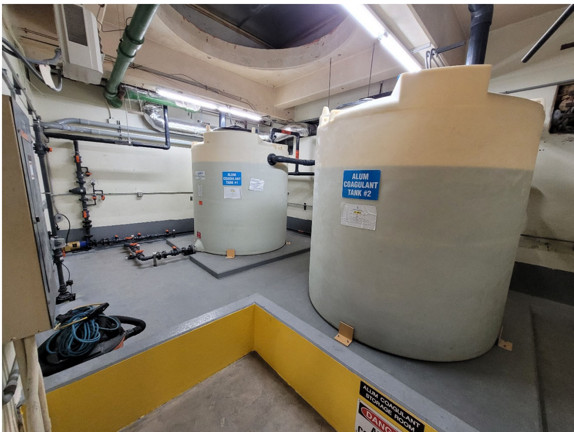
New bulk storage pads and secondary containment in the new ACH storage room.

Schedule: Project scheduled to be substantially completed August 2022 but now projected to be completed in October 2022.