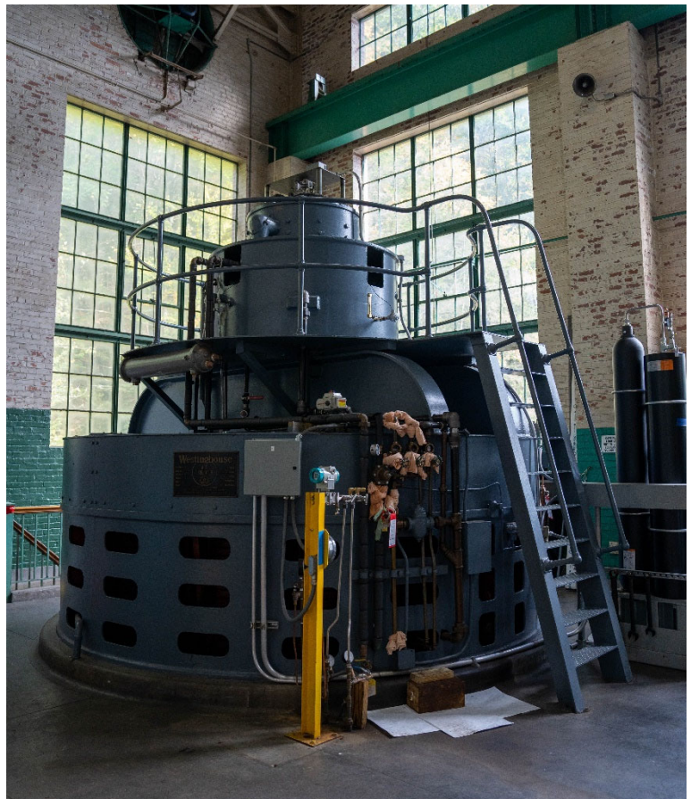
CMHS Existing Turbine #1

Schedule: This project is currently projected to be completed in 2027, but this date is subject to change as design progresses.