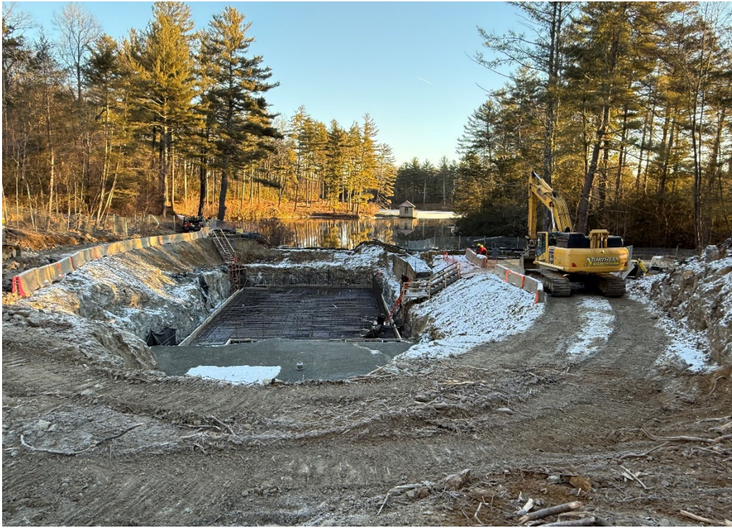
Excavation for new EDV Facility (photo by AECOM, 12/27/2024)