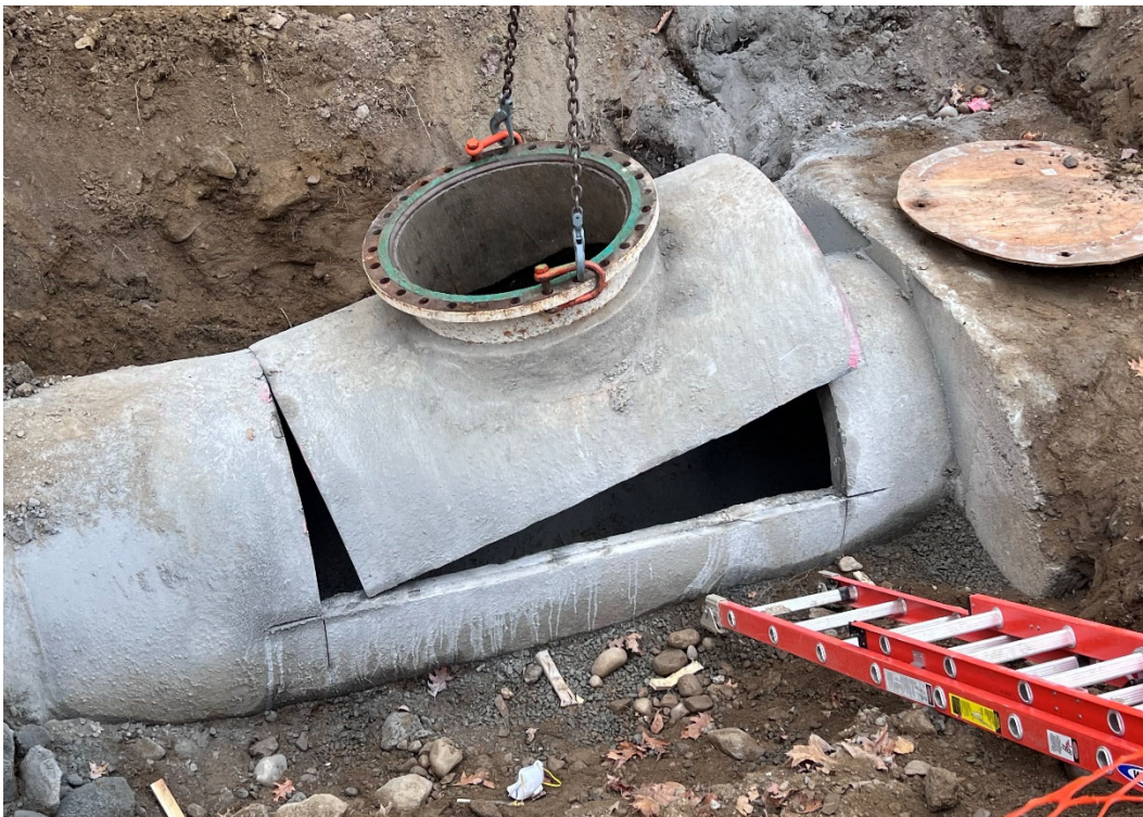
Removing flange at MH #1B for joint testing access (photo by AECOM, 11/05/2024)