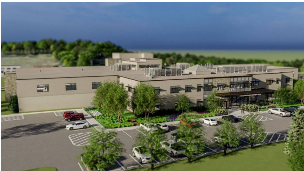
New West Parish WTP Rendering