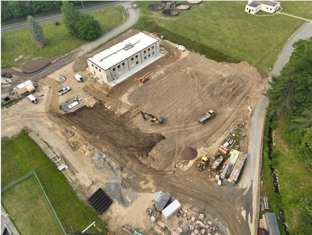
Backwash Pump Station & Clearwell Site, 06/07/23