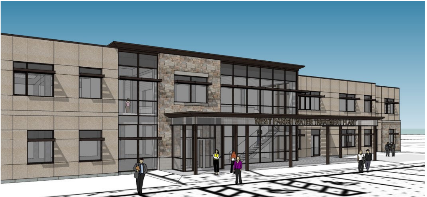
Updated progress renderings of future water treatment plant by Hazen (May 2023)