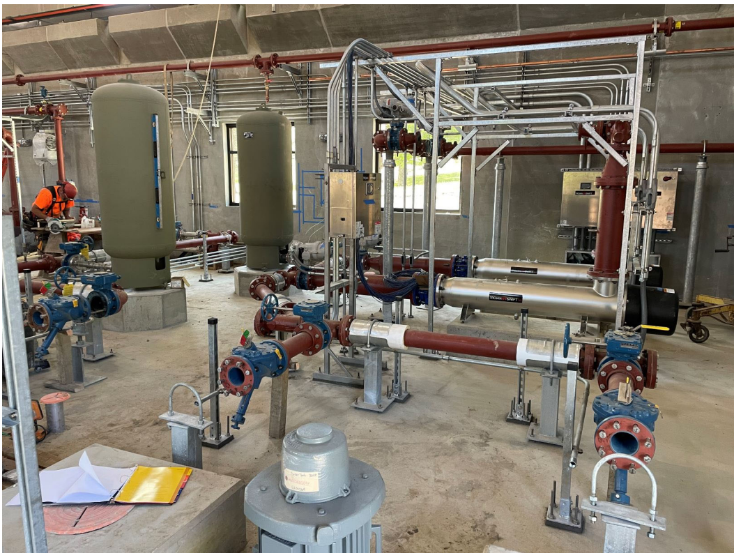
Domestic Water System equipment installed in Pump Station, 05/26/23