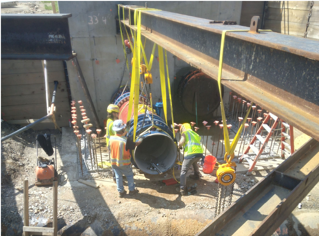
New pipe connection to Hydraulic Control Structure