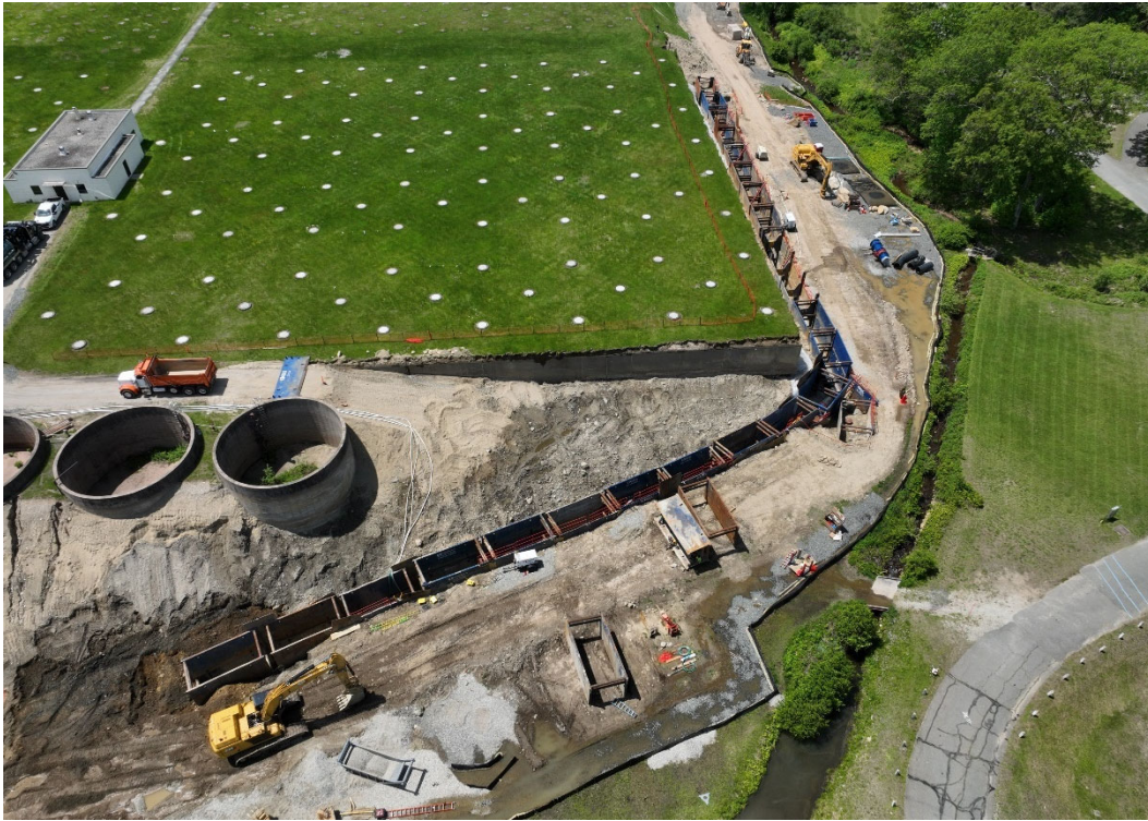
Trench boxes for HDPE Transmission Main (SWSC drone photo 05/27/2025)