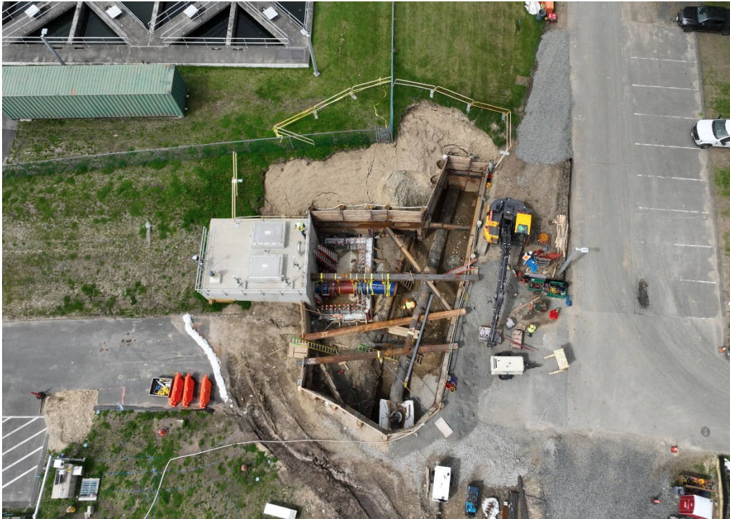
New connection at the Hydraulic Control Structure (SWSC drone photo 05/19/2025)