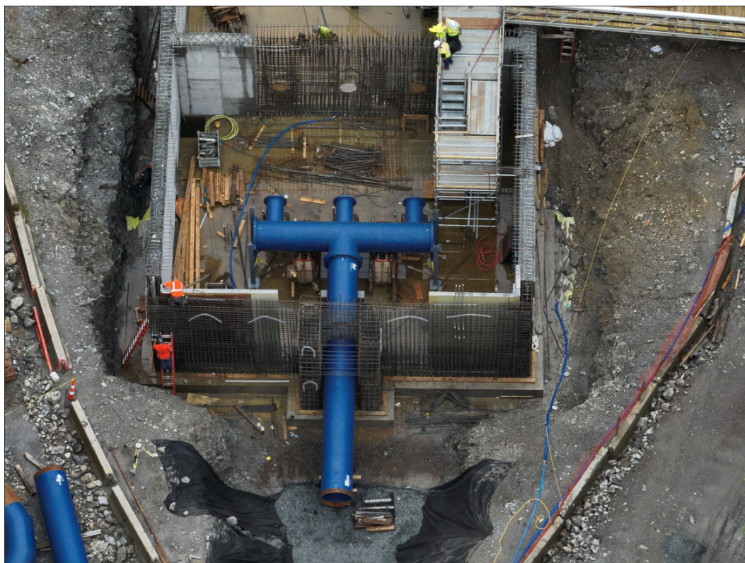
Steel pipe manifold at EDV structure (SWSC drone photo, 06/18/2025)