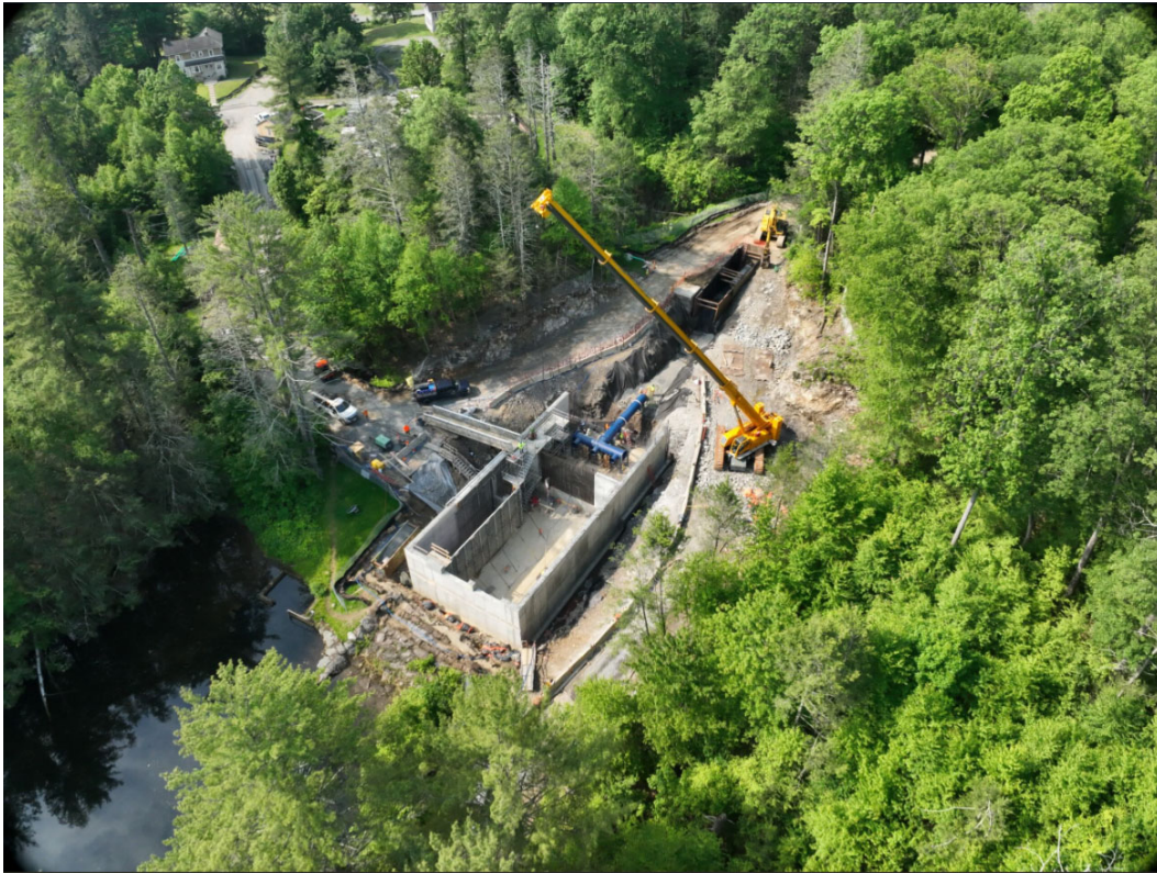
Construction of the EDV structure (SWSC drone photo, 06/05/2025)