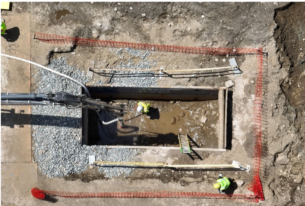
Groundwater Control at Transmission Main Connection (SWSC drone photo 05/27/2025)