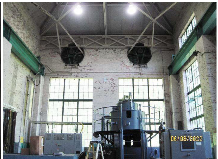
Powerhouse Generator Room in 1931 (left), Powerhouse Generator Room in 2022 (right)