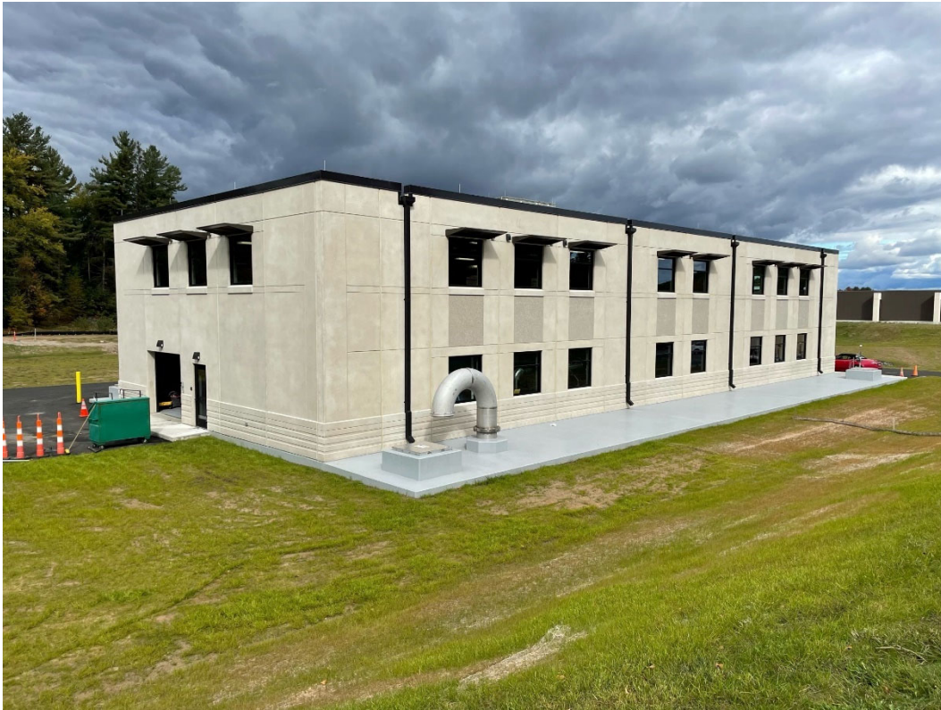
Backwash Pump Station & Clearwell Facility, 10/17/2023