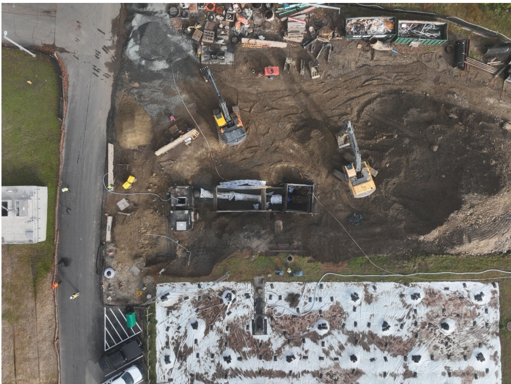
First transmission main connection, 10/19/2023