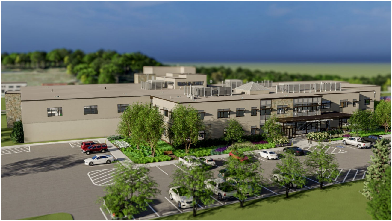
October 2023 progress rendering of the new WTP exterior and landscaping